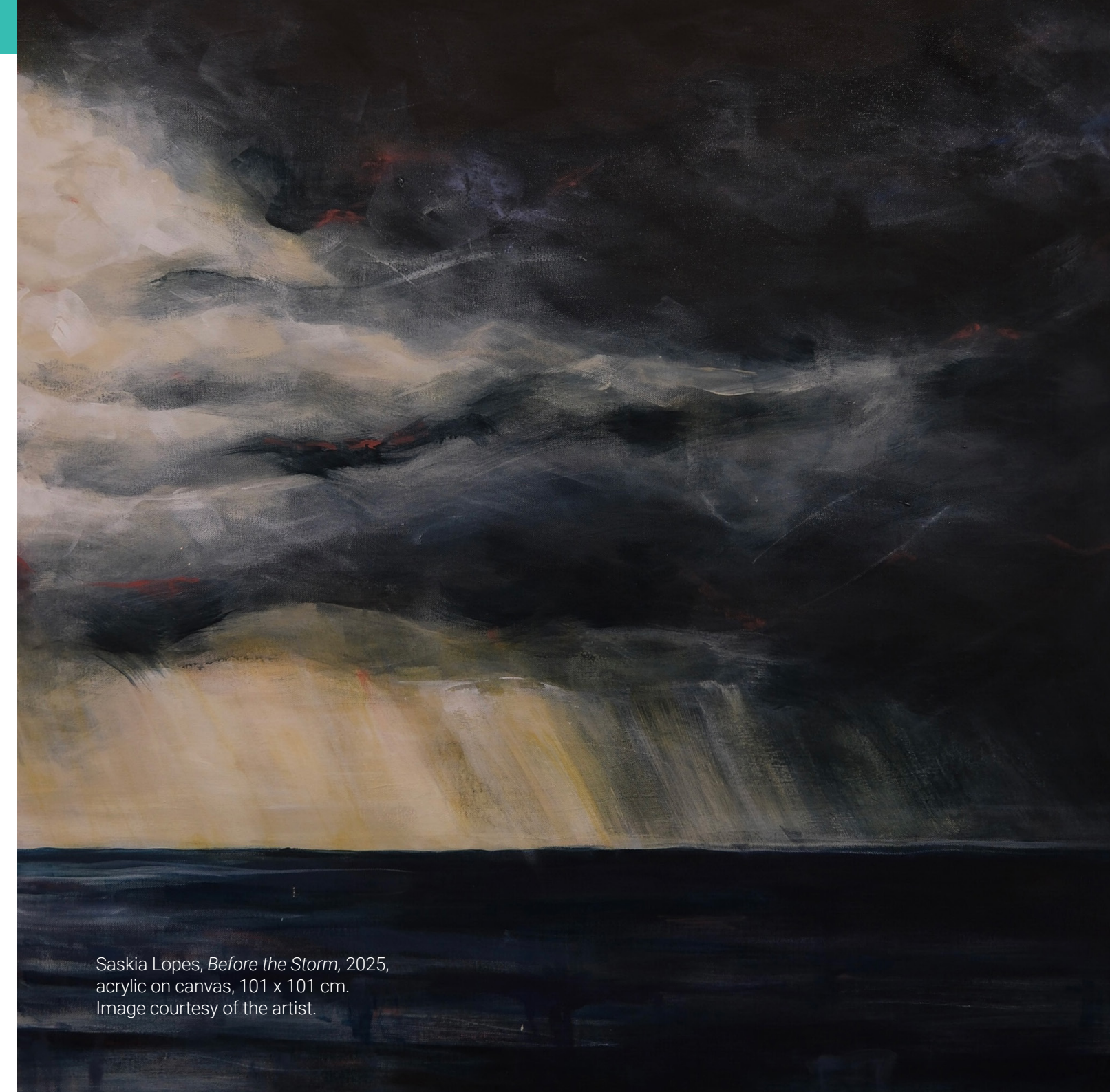
Saskia Lopes, Before the Storm , 2025, acrylic on canvas, 101 x 101 cm.