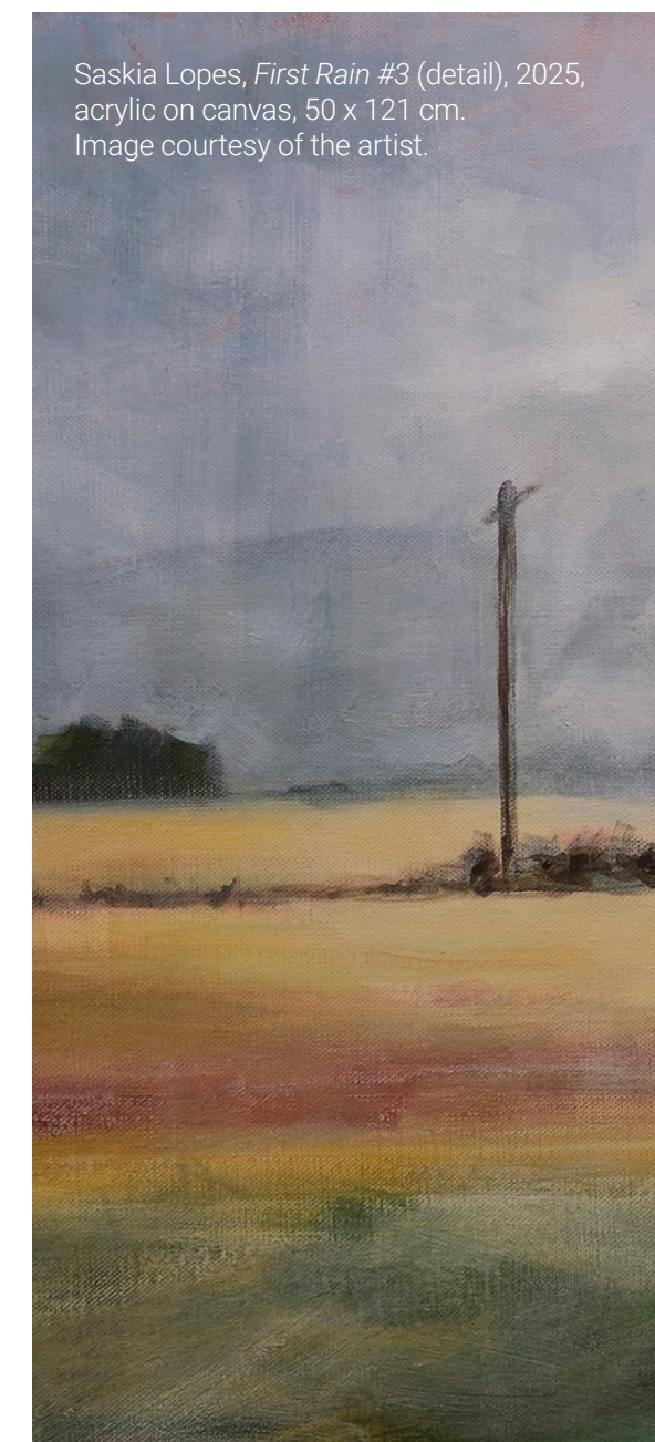
Saskia Lopes, First Rain #3 (detail) , 2025, acrylic on canvas, 50 x 121 cm.

Other works focus on weather changes, moments just before or just as rain begins, emphasising the charged stillness of anticipation. These liminal moments - quiet, fleeting, and often overlooked - hold both beauty and tension, and in them joy and grief coexist. The layering of washes and the selective removal of paint mirrors this conceptual framework, revealing the accumulation of experience while allowing space for the unexpected to emerge. Spiritual reflection is also present, as the artist learns to trust God in the waiting, seeing the pause itself as meaningful, full of grace, and deeply beautiful.