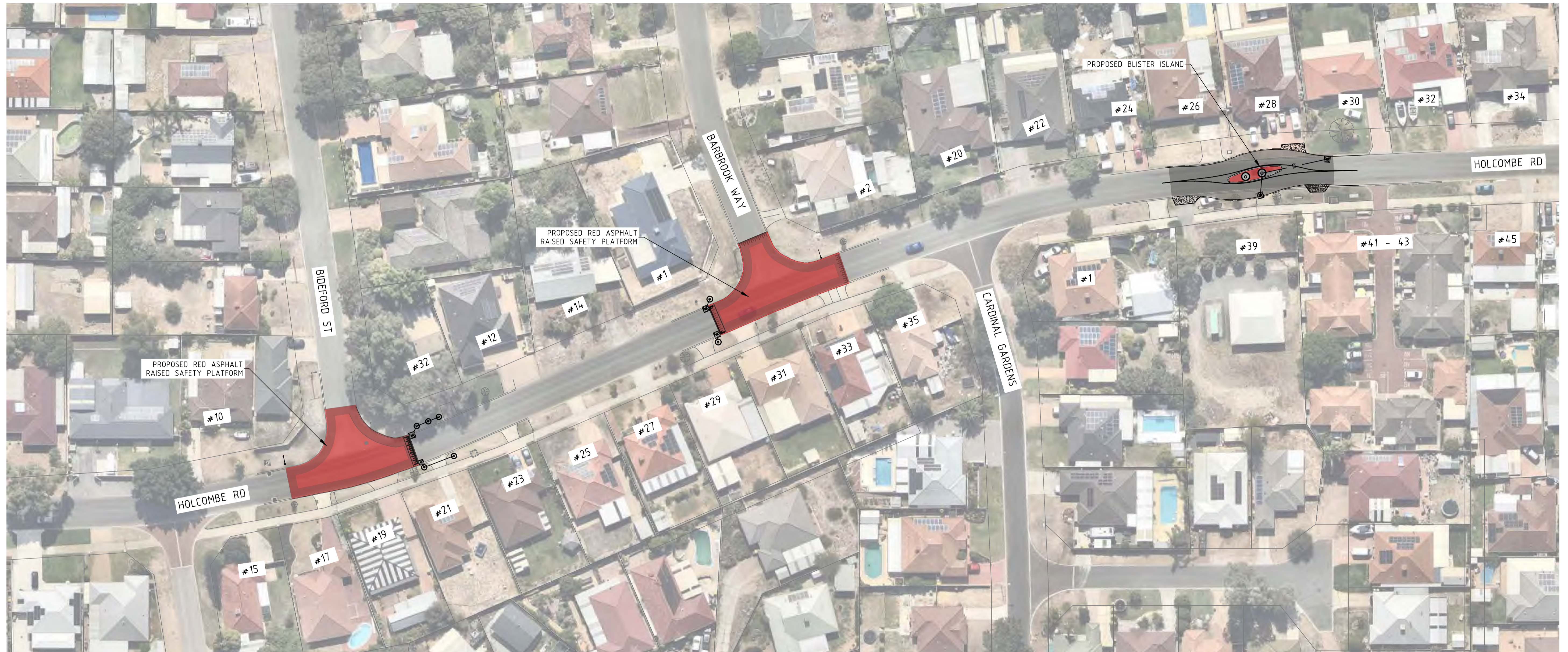
PLAN SCALE 1:500