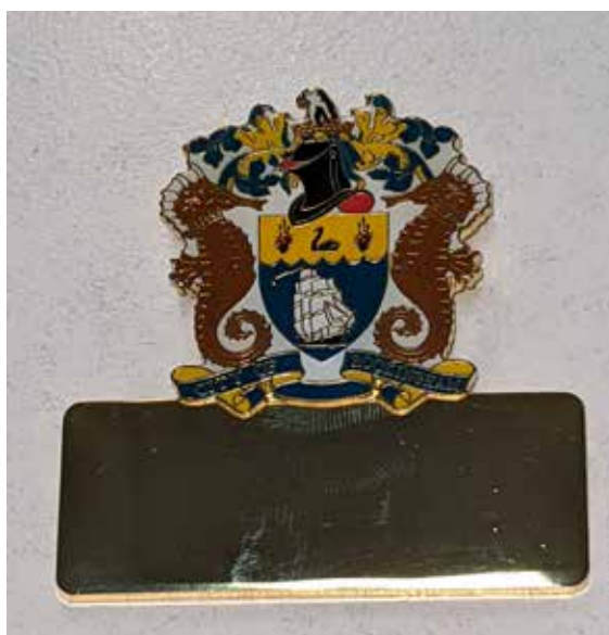
Example of Badges as per Style Manual Version