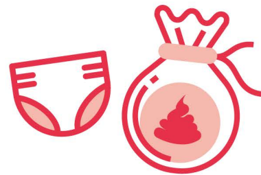
Personal hygiene items