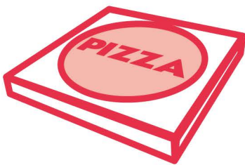
Soiled paper and cardboard