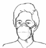
Diagram 2 – see Work Procedure 2