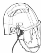
POWERED AIR PURIFYING VENTILATED HELMET RESPIRATOR