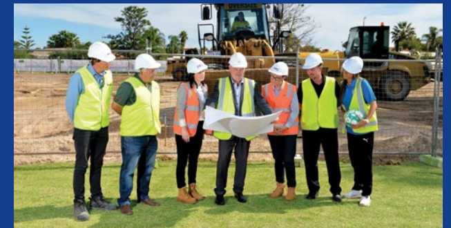
Koorana Reserve Expansion