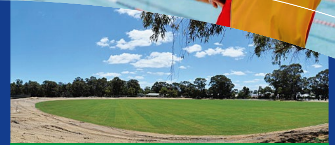
Baldivis District Sporting Complex