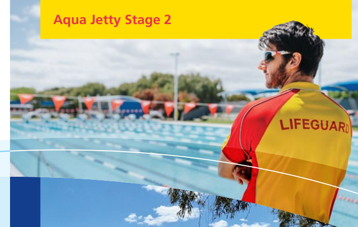
Aqua Jetty Stage 2