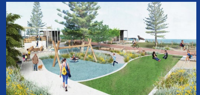
Shoalwater Activity Node