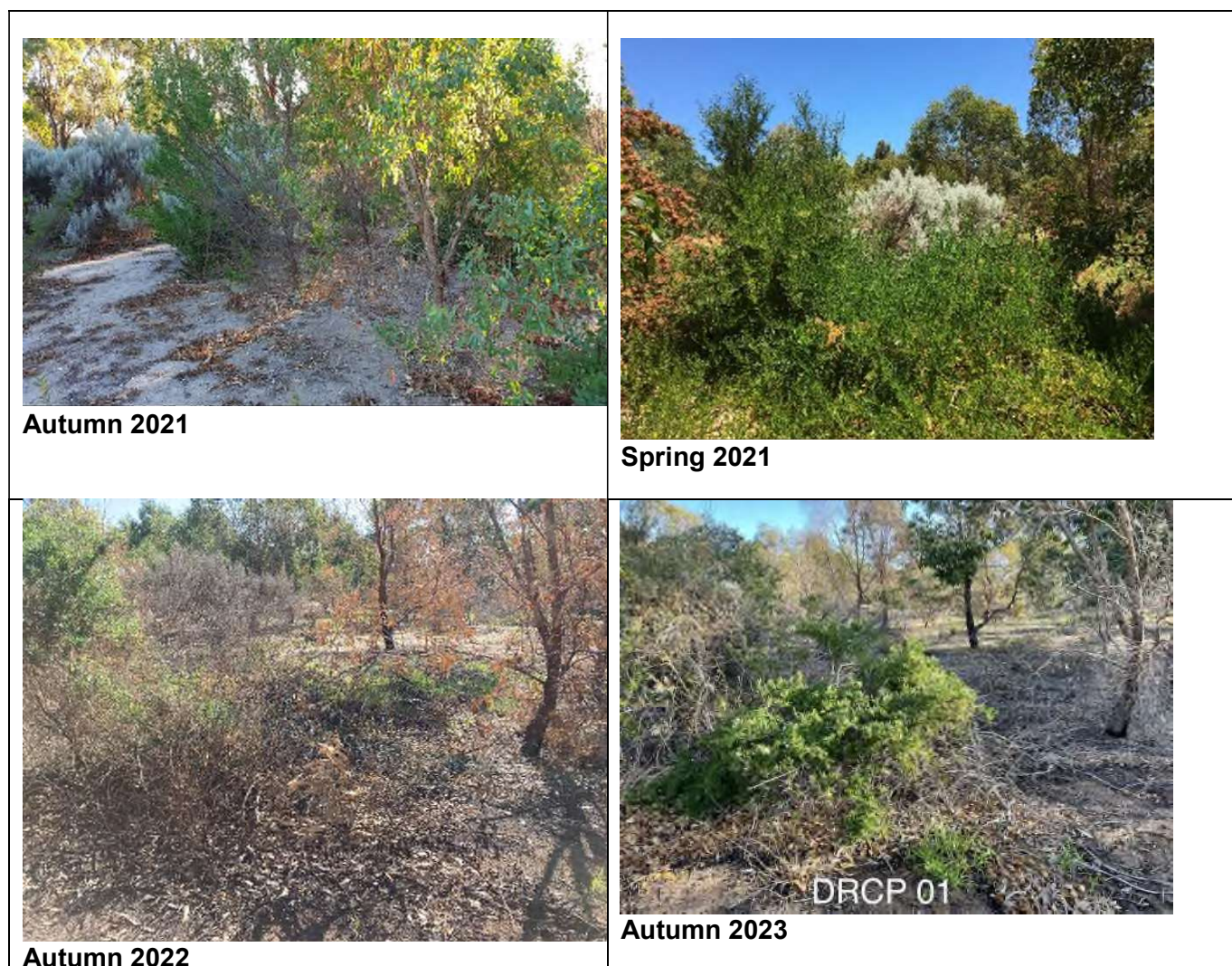
Table 7: Revegetation monitoring – Quadrat 1 Dixon Road Conservation Precinct