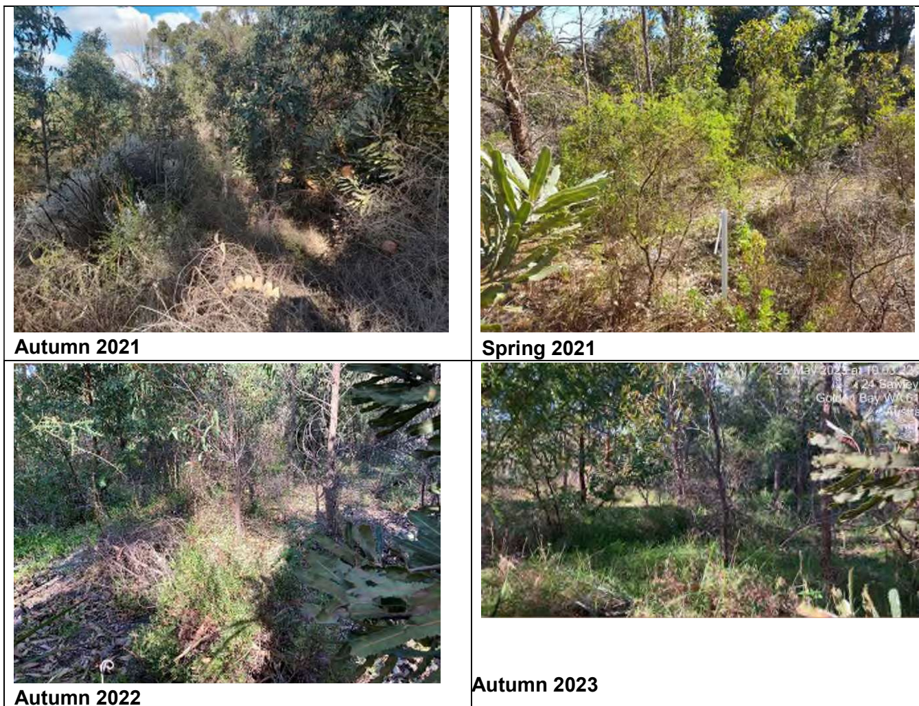
Table 11: Revegetation monitoring – Quadrat 2 Trenant Park Wetland