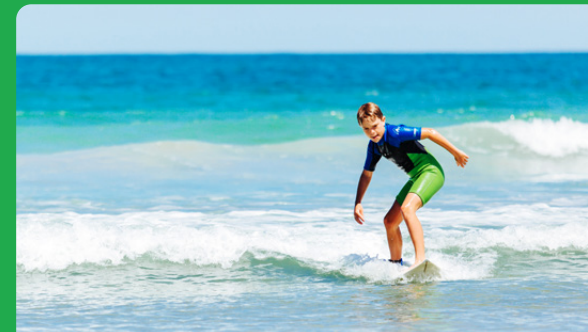
Surfing Secret Harbour