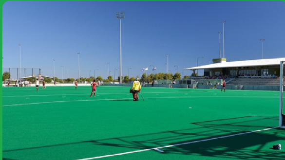
Synthetic turf hockey field