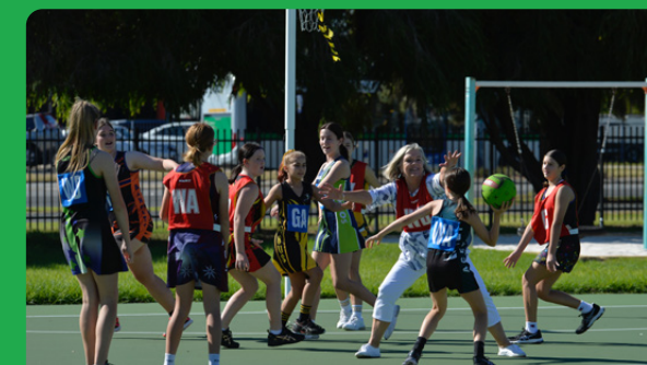
Fully accessible courts