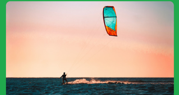
'The Pond' Waikiki Beach