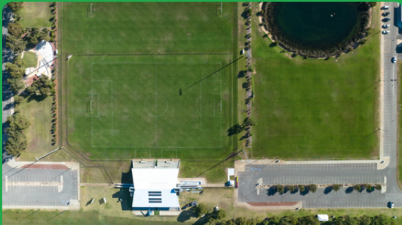
Ample parking available