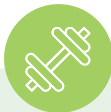
Group fitness classes