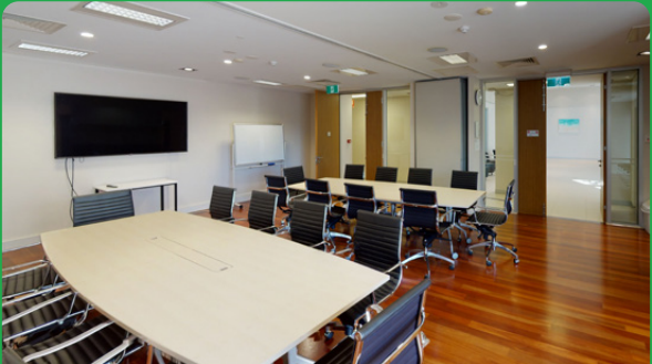
Meeting room 24 pax