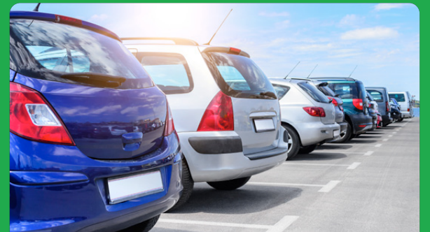
435 nearby car parking bays 17 ACROD bays (untimed)