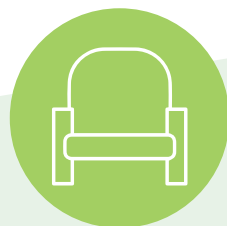
Kiosk seating area