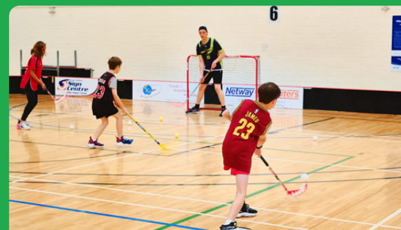
Indoor and outdoor facilities