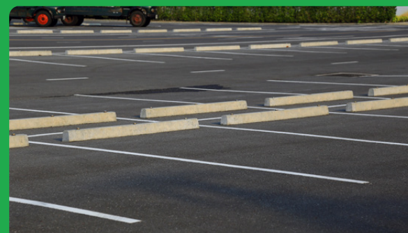
100+ parking bays