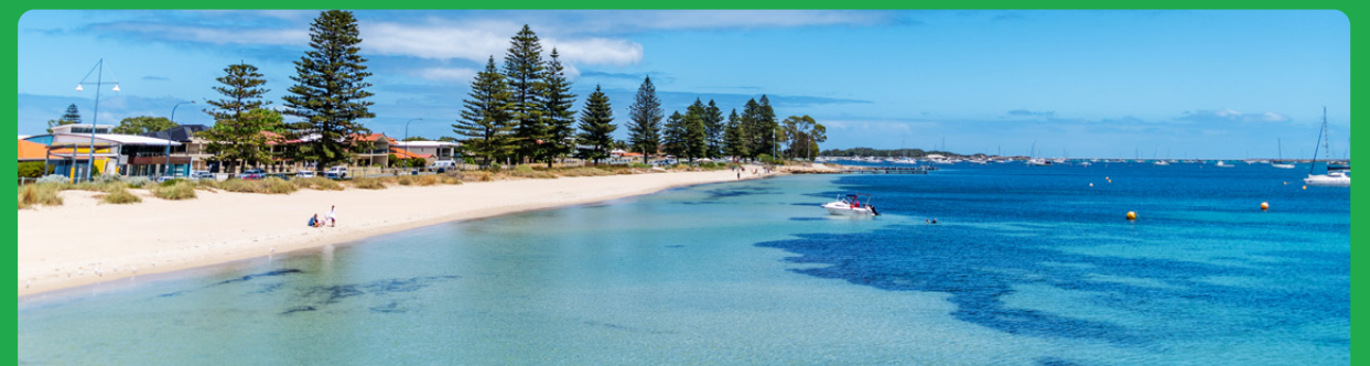
Palm Beach Rockingham