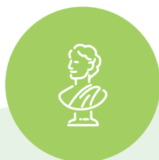
Castaways Sculpture Exhibition (October)