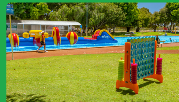
Grass picnic areas