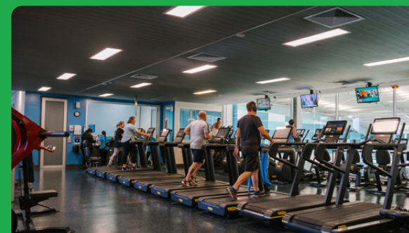
Fully equipped health club