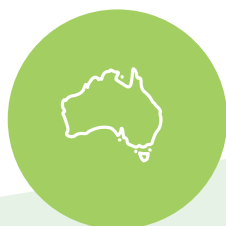
Australia Day Celebrations (January)

The Rockingham Foreshore is brought to life throughout the year with a number of the City's much loved events, including: