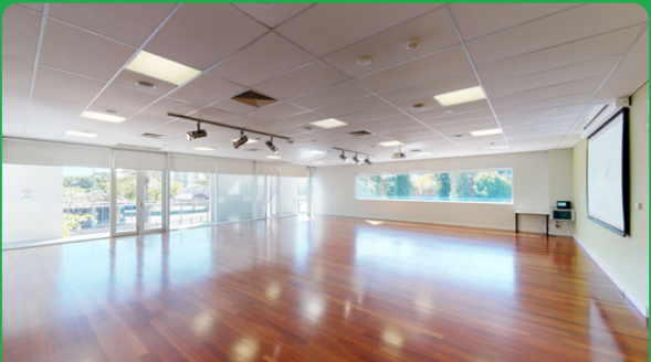
Multipurpose room 90 pax