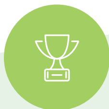
Channel 7 Rockingham Beach Cup (November)