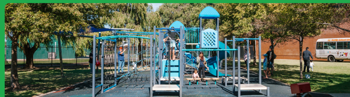
Outdoor playground and BBQ facilities