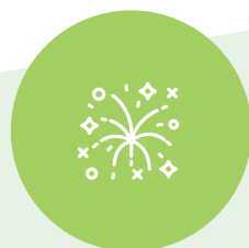
New Year's Eve Fireworks (December)