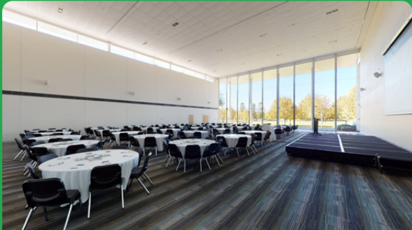
Main hall 300 pax