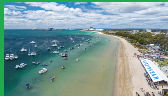
Approximately 700m foreshore length