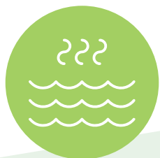
Heated 50m pool

This venue is ideal for swimming events, and is a great place to train whilst visiting for your next event in Rockingham.