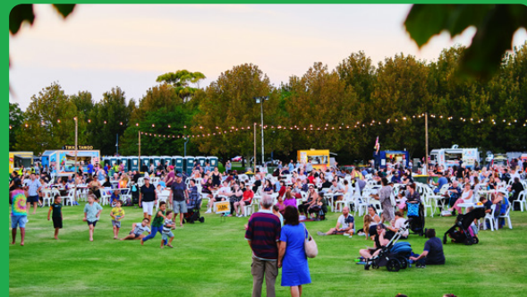
Approximately 11,000 m 2