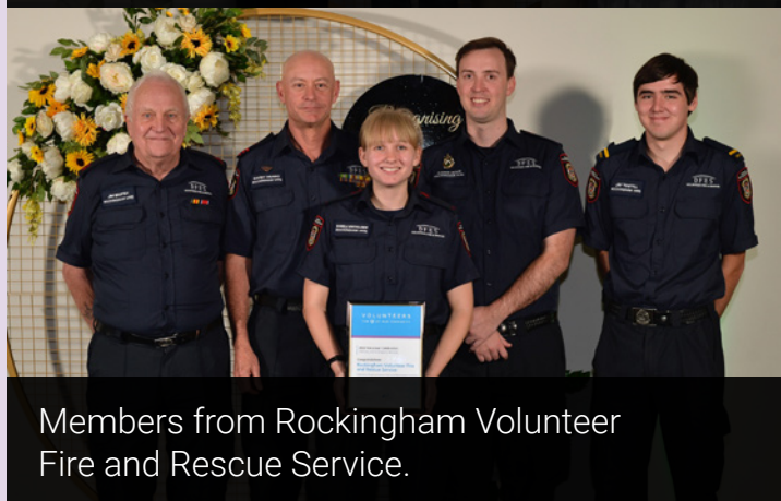
Members from Rockingham Volunteer Fire and Rescue Service.