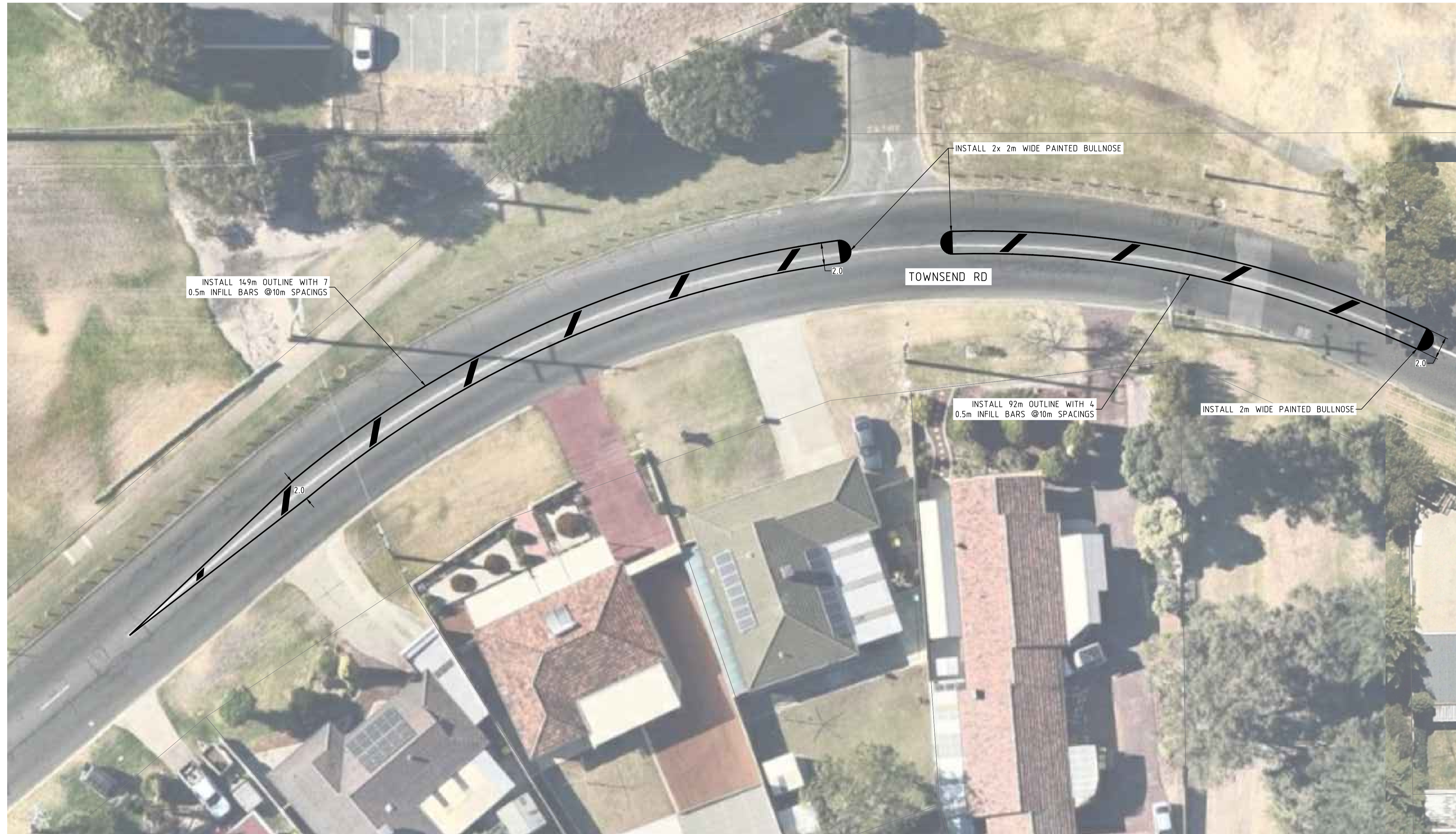
PLAN SCALE 1:200