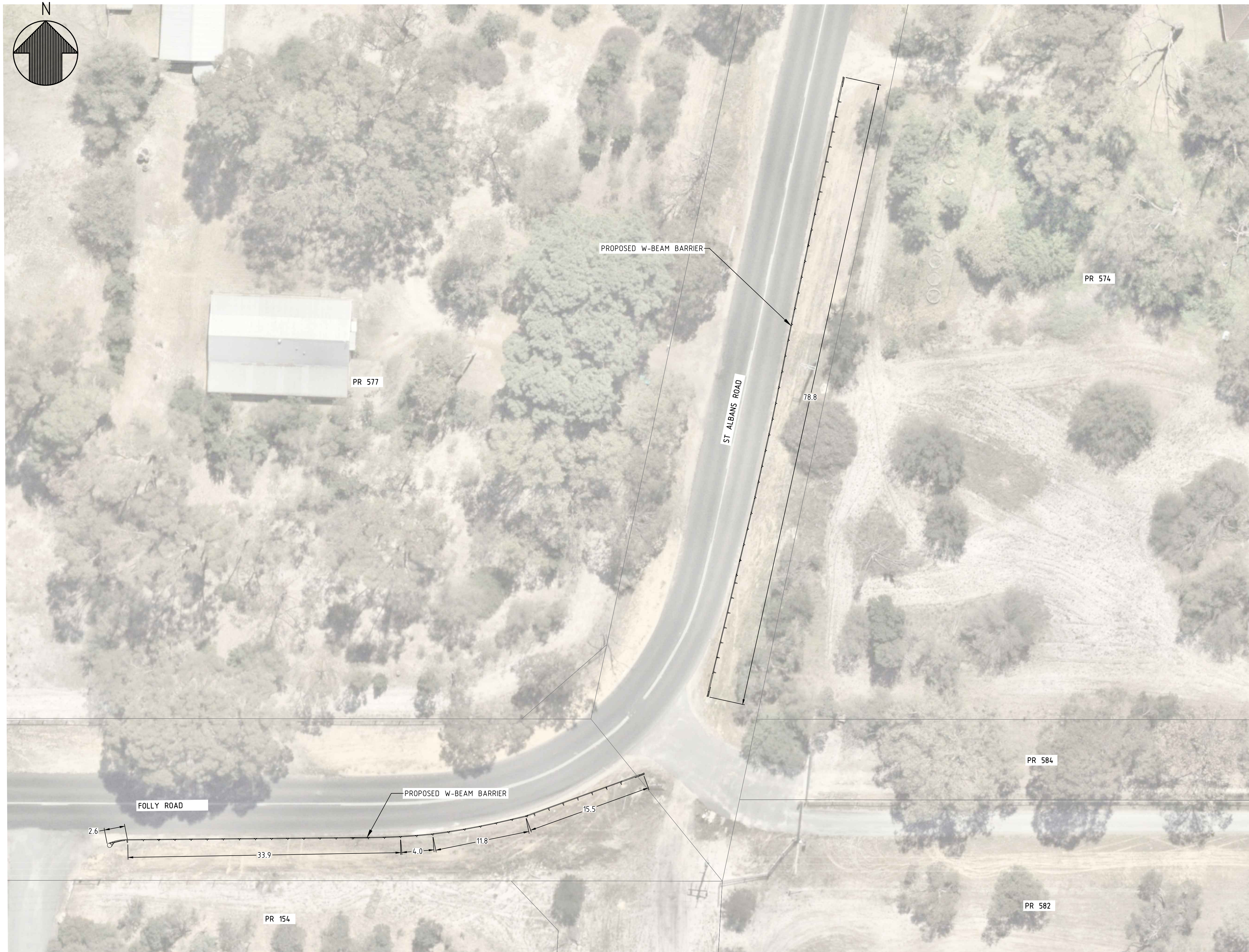
PLAN SCALE 1:250