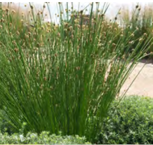
ISO NOD Isolepis nodosa