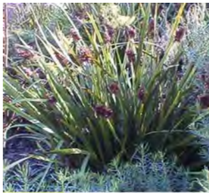
LEP EFF Lepidosperma effusum