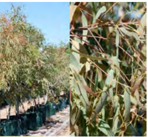
EUC SNQ Eucalyptus 'Snow Queen'