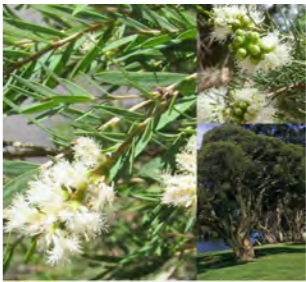
MRA Melaleuca raphiophylla