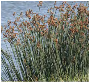
JUN PAL Juncus pallidus