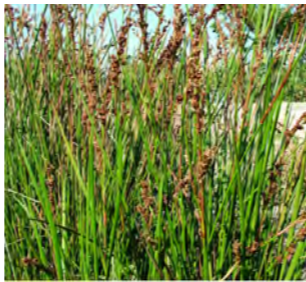
BAU RUB Baumea rubiginosa