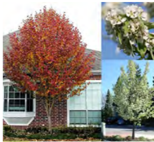
PYB Pyrus calleryana 'Bradford'