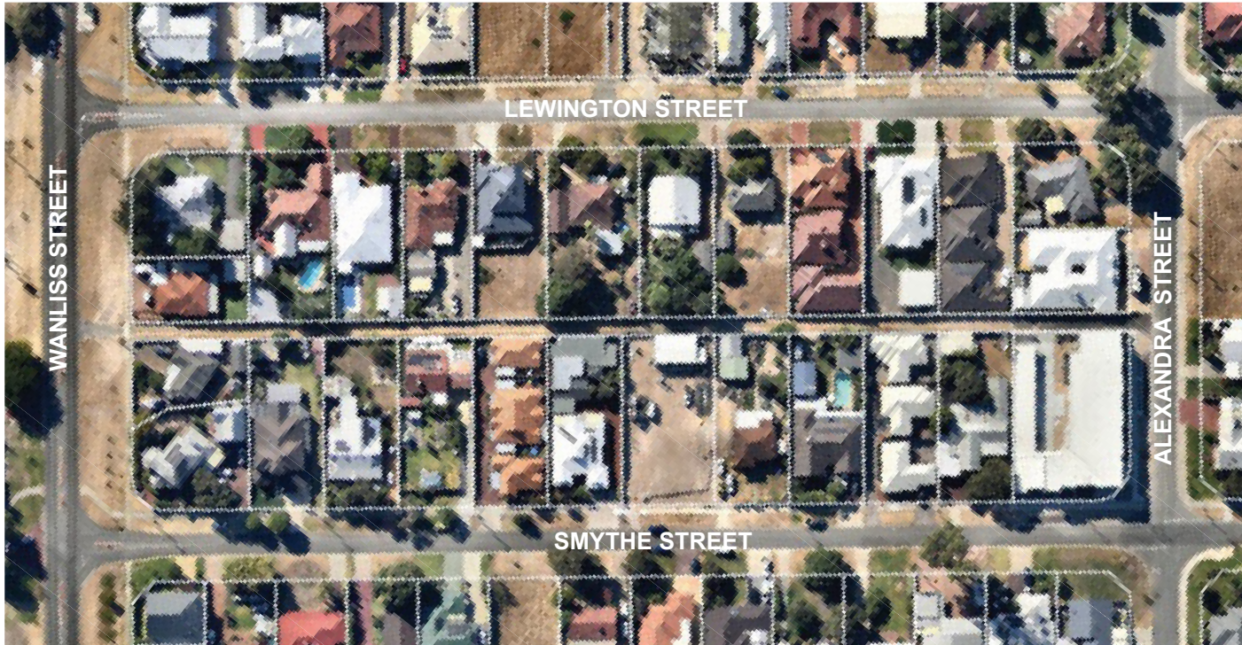
SMYTHE STREET CASE STUDY (WITHIN COASTAL LOTS SUB-PRECINCT) - EXISTING