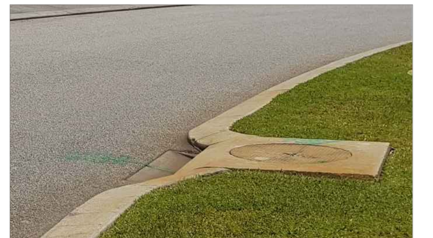
SIDE ENTRY PIT