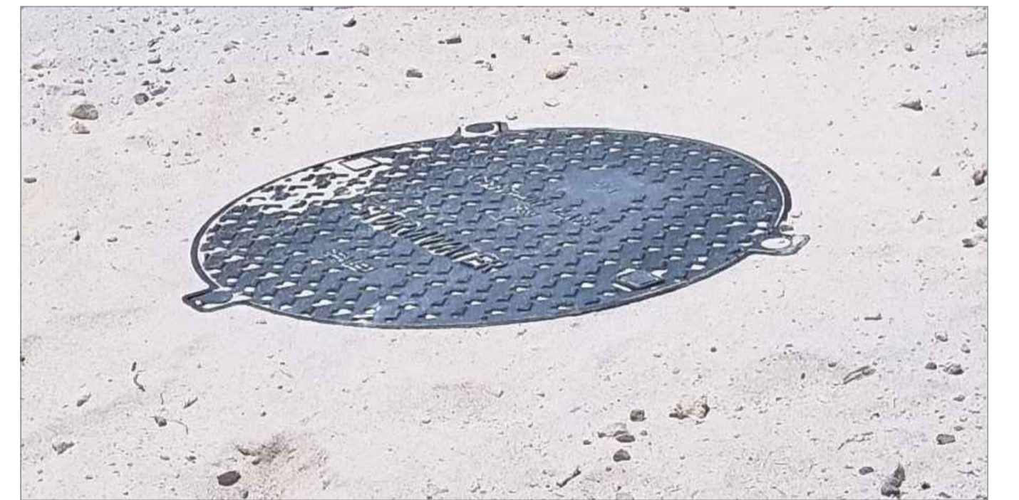
SOAKWELL WITH EXPOSED RAISED LID