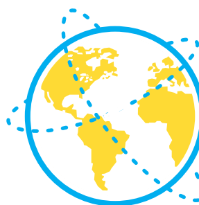
Travelling outside of Australia (International)