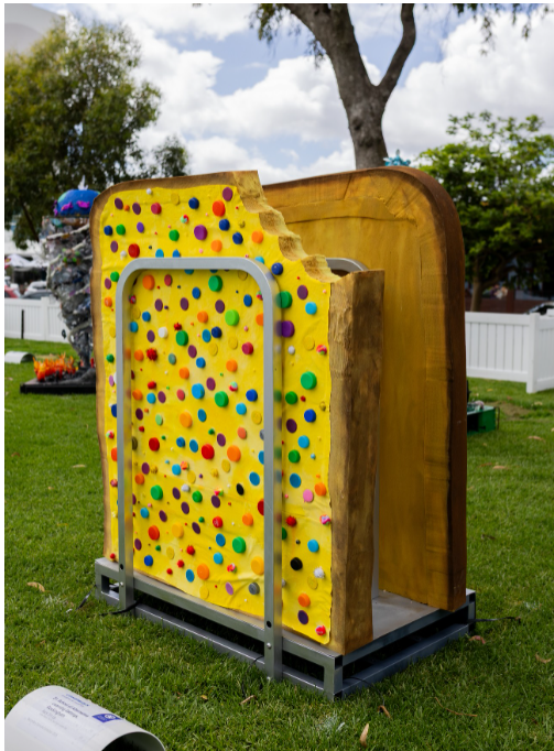
School of Alternative Learning Settings, Rockingham, Rack 'Em Up , 2025, metal display frame, hard foam, plastic lids

For more information, visit rockingham.wa.gov.au/castaways or call 9528 0333.