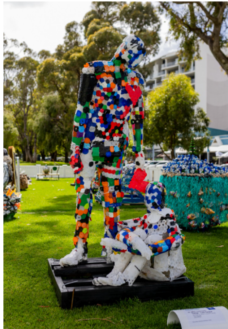
SMYL Community College – Tesla Campus, Bottled Up: When I couldn't Speak, You Stayed , 2025, plastic bottle tops.