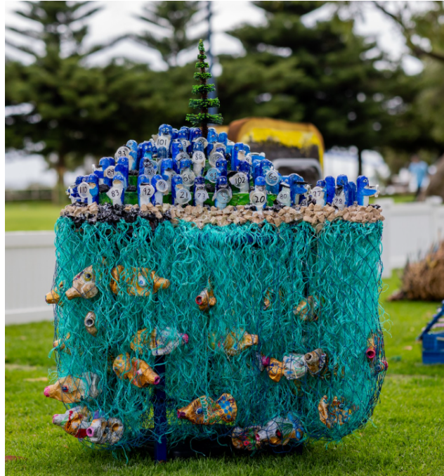
Safety Bay Primary School, The 114 , 2025, foam, papier-mâché, plastic bottles, empty threaded CO2 cartridges.