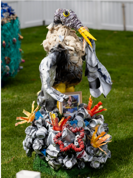
Rockingham Beach Primary School, Peggy the Seabird , 2025, wire, carpet, fake grass, cans, bottle caps, milk crate, papier mâché.