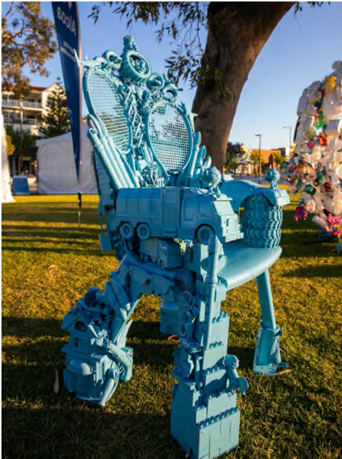
Endeavour Education Support Centre, The Broken Throne , recycled broken plastic toys and an old school chair, Castaways Sculpture Awards 2020.

For more information, visit rockingham.wa.gov.au/castaways or call 9528 0333.