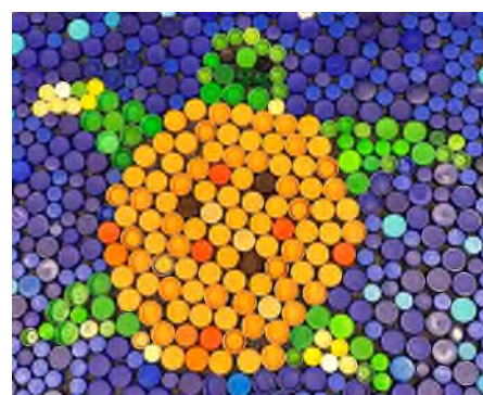
SMYL Community College, How will you care for your oceans? , chicken wire, drink bottle lids, recycled plastic, ribbon, Castaways Sculpture Awards 2023.