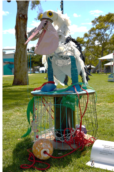
Rockingham Beach Education Support Centre, I'm a pelican, not a trash CAN , 2024, lampshade, wire fruit baskets, vacuum parts, milk bottles, tyre tubes, gym ball