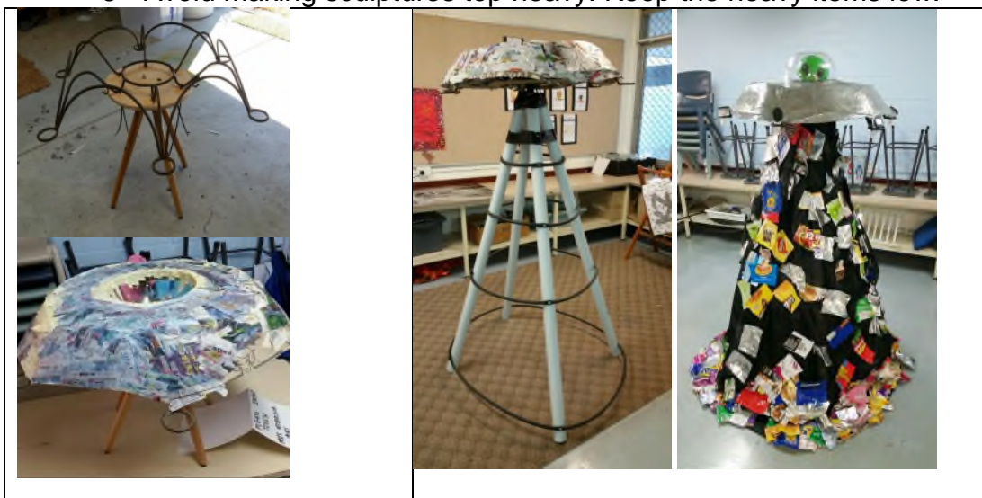
Hillman Primary School, URV – Unidentified Recycling Vehicle , 2019, metal chandelier, PVC pipe, shade cloth, rubbish.