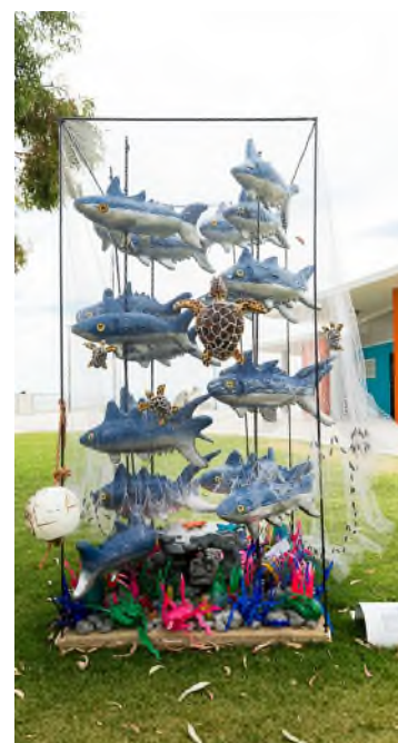
Rockingham Beach Primary School, Tangled Web , papier-mâché, fabric scraps, mannequin, PVC pipe, Castaways Sculpture Awards 2019 People's Choice Award Winner.