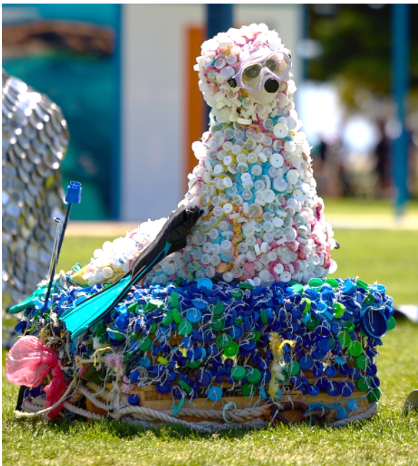
Endeavour Schools, Scavenger Seals , 2024, recycled objects.