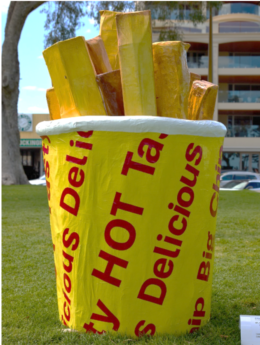
South Coast Baptist College, The Hot Chip Effect , 2024, copper pipe, pine, cardboard, canvas.