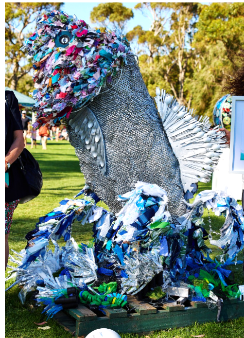
Rockingham Montessori School Adolescent Program, Outer Harbour , 2024, recycled ring-pulls, fabric, wire, metal, wood, plastic