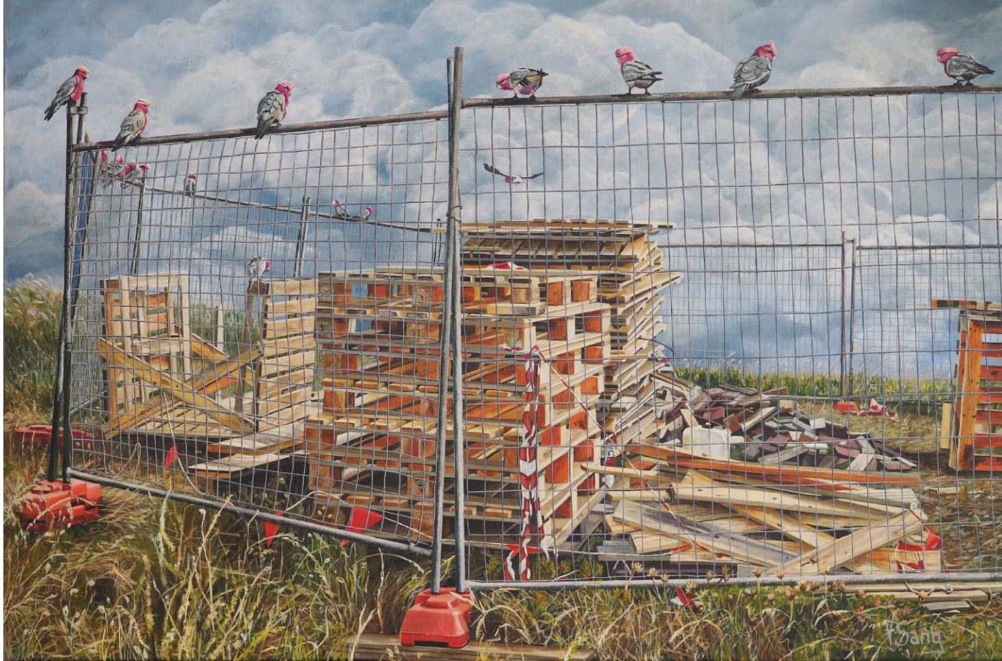
Vicki Sangster, Construction Crew Prestart , 2025, acrylic on linen, 61 x 91.5 x 3.5 cm.