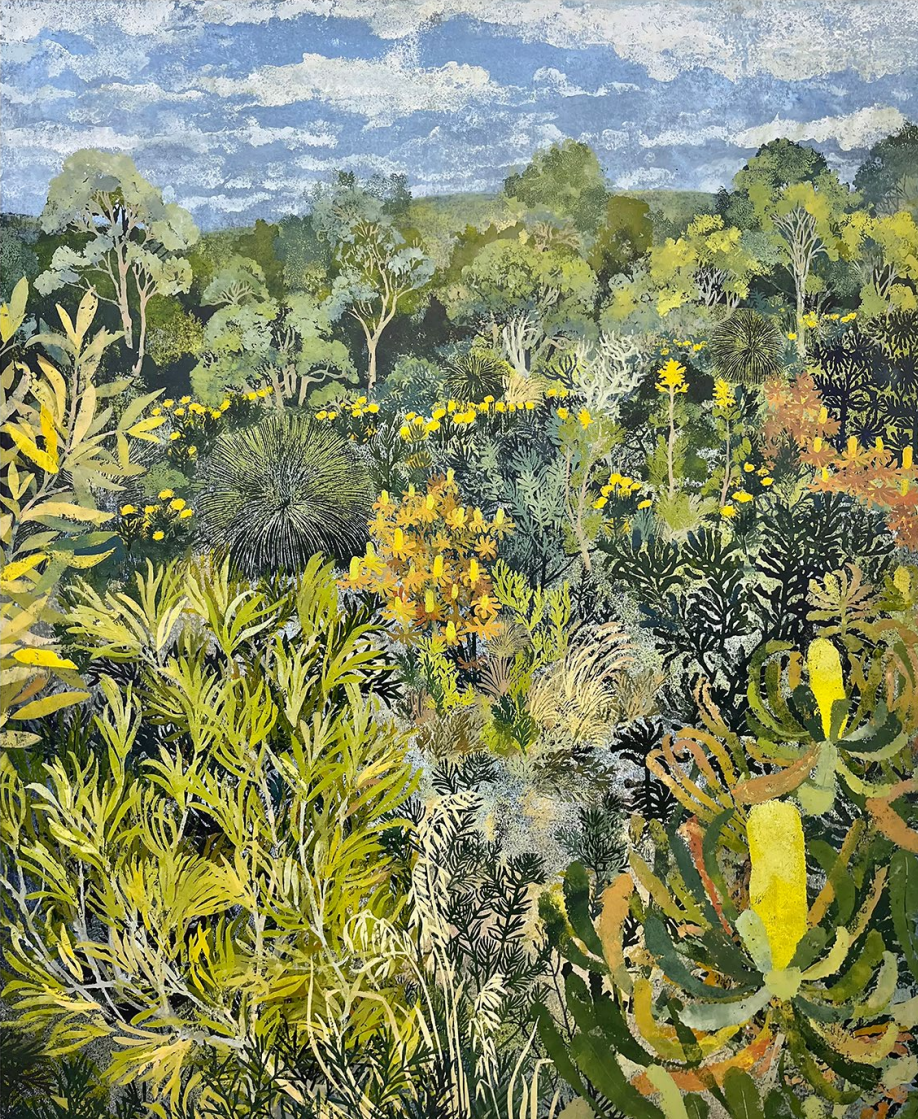
Dominique Coiffait, In Celebration of the Green & Gold , 2025, multiblock lino print over mono print ground: 60 plus hand carved lino blocks, oil based ink on paper, unique state, 90 x 75 x 5 cm.