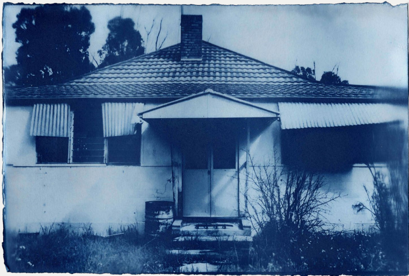
Clinton Price, Transience , 2025, cyanotype on archival paper, 57 x 47 x 2 cm.