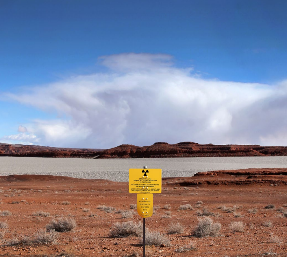
Brett Leigh Dicks, Radioactive Waste Disposal Cell, Mexican Hat, Utah (detail), 2024, photographic print, 70 x 50 x 1 cm.