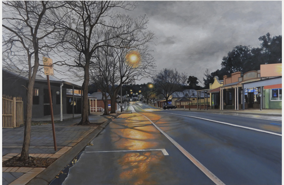
Barbara Maumill, Bridgetown , 2024, acrylic on canvas, 61 x 91 cm.

A red dot on the artwork label indicates it is sold.