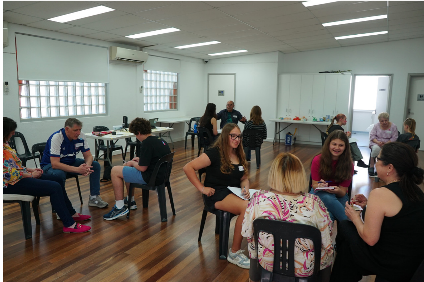
Storytelling Workshop, 2024.