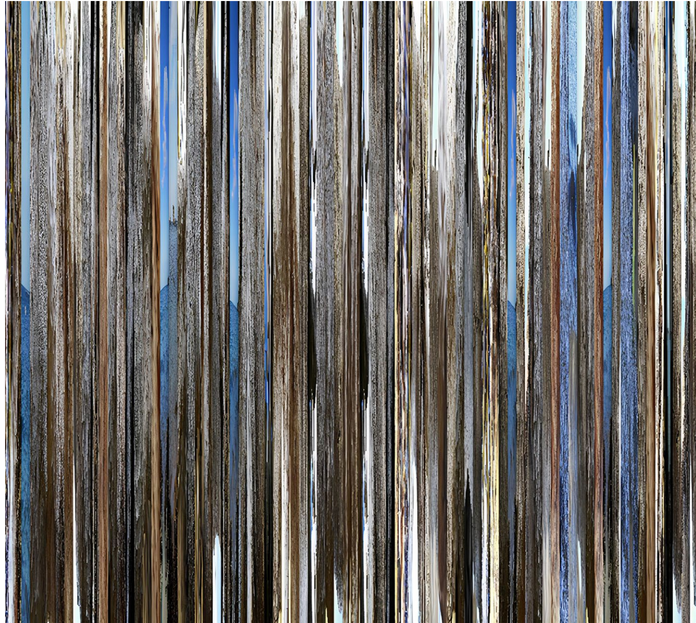
Rae Walter, Winter Fragments 1 , 2023, multi-media print, dimensions variable.