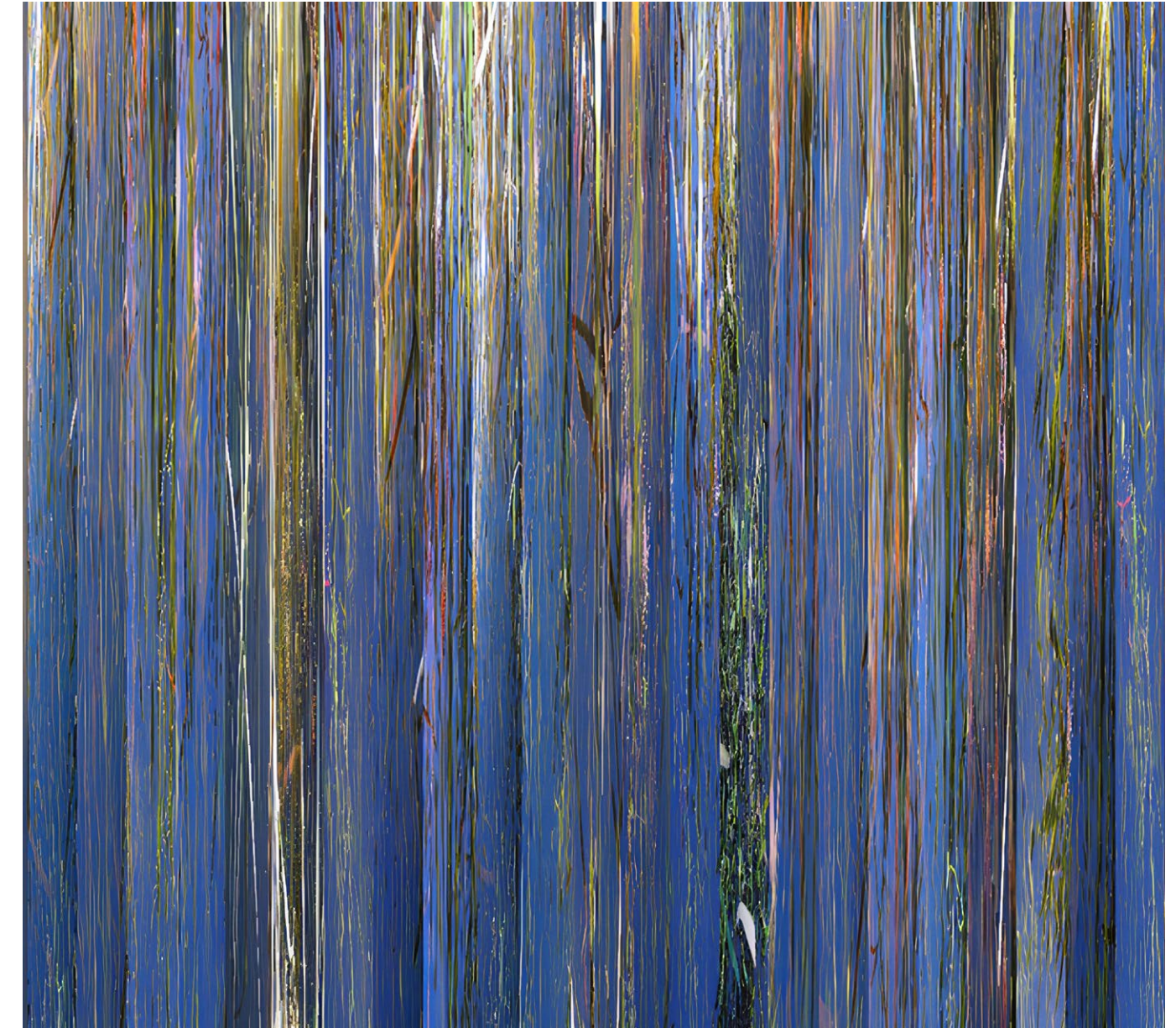
Rae Walter, Spring Fragments 1 , 2024, multimedia print, dimensions variable.