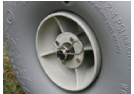
Reinstall Hitch Pin to retain wheels.