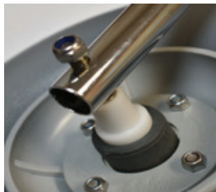
Install and tighten lock nut