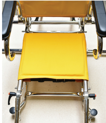
Install seat bottom pad and attach buckles.