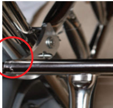
Locking bar and pin engaged.

Note: Maintain foot pressure on the parking brake during this step - wheel tire pressure will force the parking brake handle up quickly, which may result in the bar striking your leg.