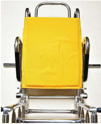
Install seat back pad and attach buckles