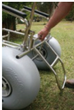
Release Lock Bar.