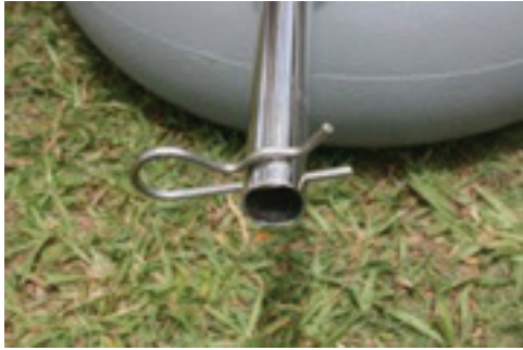
Remove Hitch Pin from axle.

Note: Ensure axle is clean - free of grit, sand, dirt, etc. prior to installing wheels.