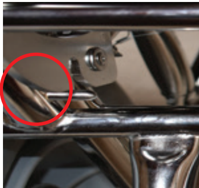
Locking bar and pin disengaged.

To release the parking brake, push down firmly with your foot to move the locking bar up to release the pins.