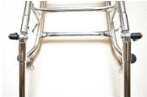
Foot rest to frame assembly.