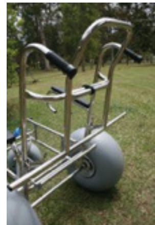
Rotate up-secure with strap.