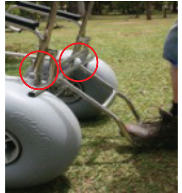
Rotate rearward and down.

Note: Press down firmly on the parking brake to engage the locking bar, which prevents inadvertent release of the brake. Ensure the pins on the parking brake engage in the slots of the locking bar.