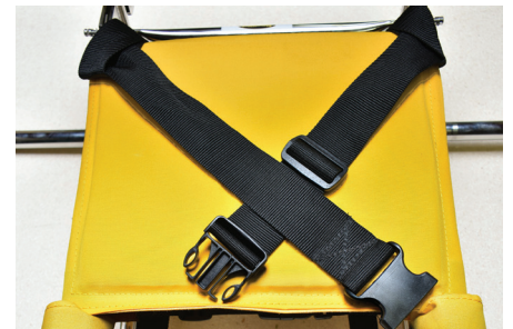
Install seat belt straps to each side of the seat frame - adjust seat belt accordingly.