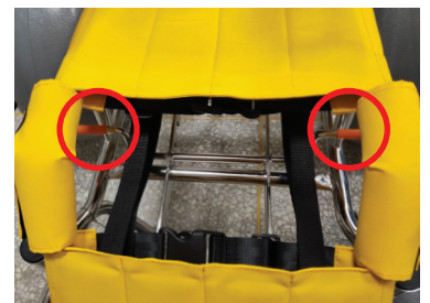
Orange levers indicated above