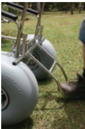
Apply foot pressure.

Note: Maintain foot pressure on the parking brake during this step - wheel tire pressure will force the parking brake handle up quickly, which may result in the bar striking your leg.