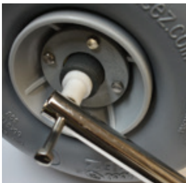
Center wheel between caster forks and install bolt