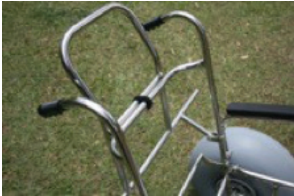
Anti-tip/ parking brake in stowed position.

Prior to engaging the mechanism ensure the Sandpiper™ is in a stable position. Loosen the strap and rotate the anti-tip/ parking brake mechanism rearward and down toward the tires and locking bar.