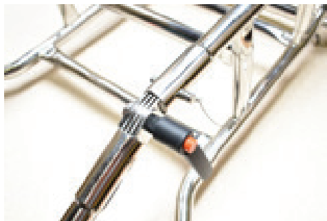
Install latch pins, both sides.