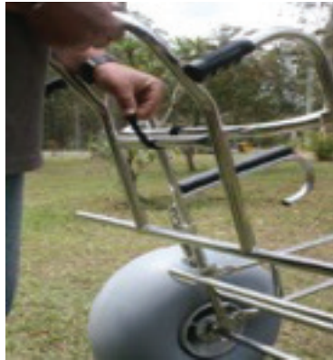
To release, undo the strap.