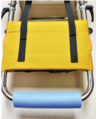
Install leg pad and foot rest foam/ wrap.