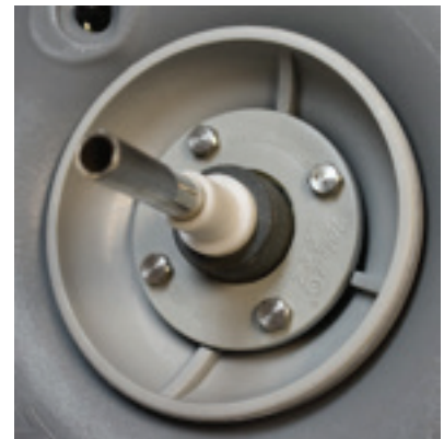
Insert metal axle sleeve