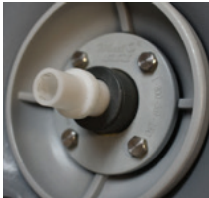
Insert bushing sleeves x2