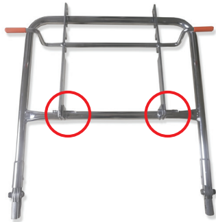
Insert latch pins (circled) to connect the Foot Rest Locking bar to footrest frame.