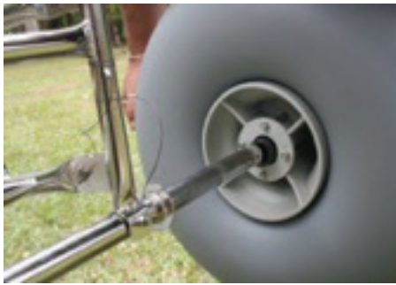
Install wheel onto axle.