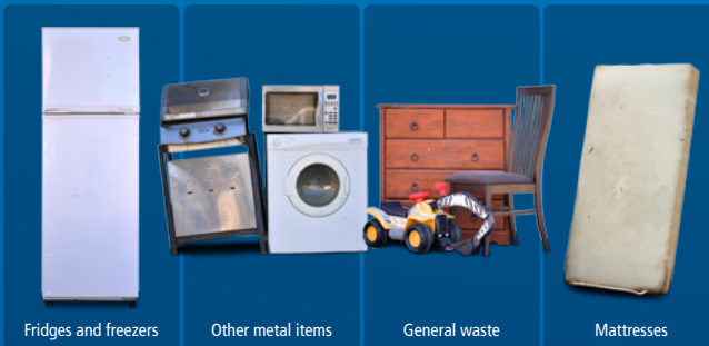
Fridges and freezers

There are four separate trucks collecting verge waste. To ensure items can be recycled please place into FOUR PILES: