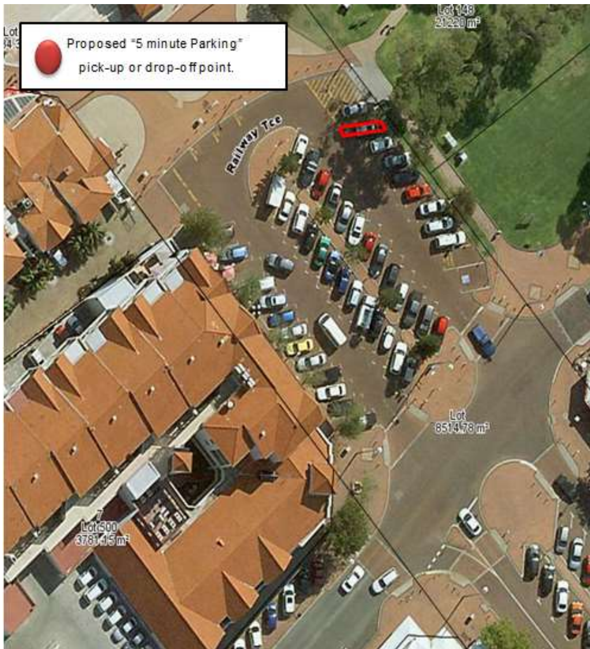
Aerial Photograph dated April 2017