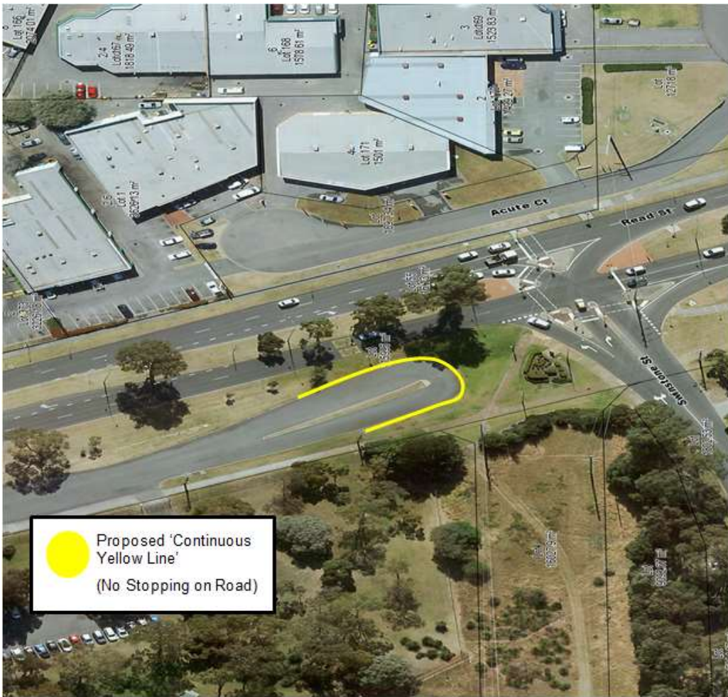
Aerial Photo 3 - Proposed Parking Control (5 September 2017)