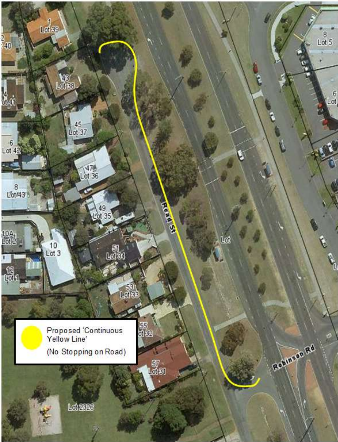
Aerial Photo 2 - Proposed Parking Control (5 September 2017)