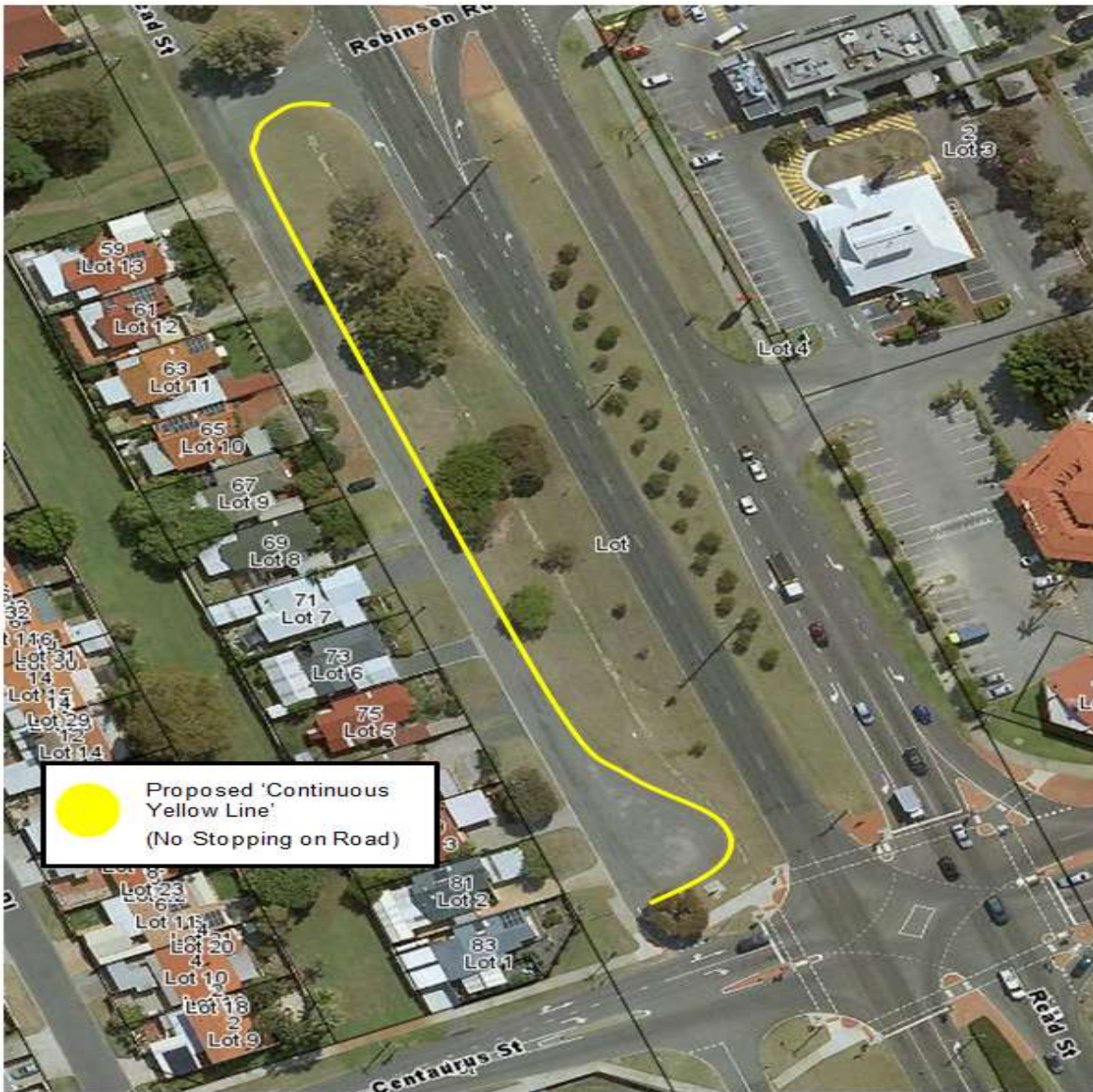
Aerial Photo 1 - Proposed Parking Control (5 September 2017)

That Council APPROVES 'No Stopping' parking control restrictions on the eastern side of the Read Street culs-de-sac access road between Centaurus Street and Robinson Road and also between Robinson Road and Swinestone Street extending in a 'U' shaped pattern adjacent to Swinestone Street, as shown in the following Aerial Photos 1, 2 and 3 dated 5 September 2017.