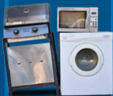
Other metal items