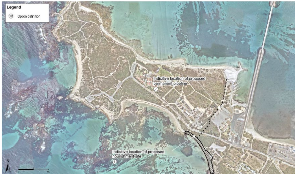
Figure 3: Recommended option for Sector 2 – beach renourishment with permanent pipe from Point Peron sand trap