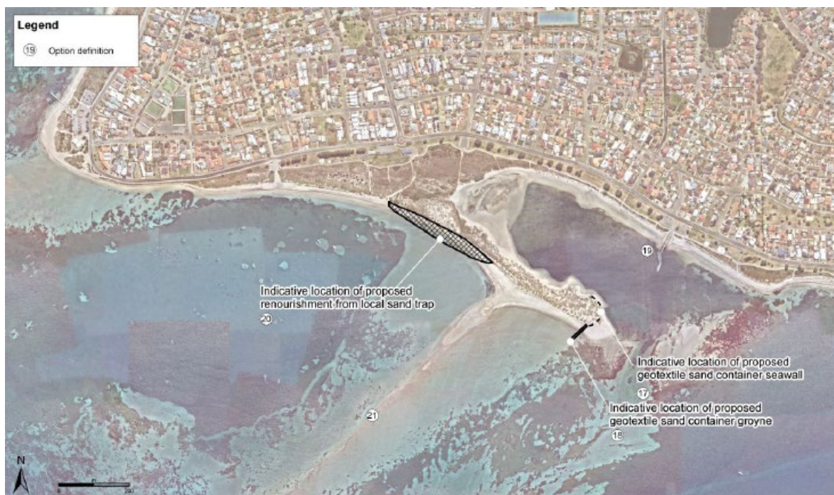
Figure 5: Recommended option for Sector 5 – Stabilise Tern Bank with terminal groyne and sand trap management (local)