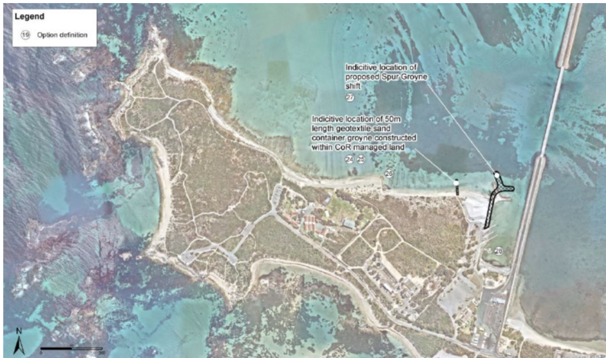
Figure 2: Recommended option for Sector 1 – shift spur groyne northward with added groyne