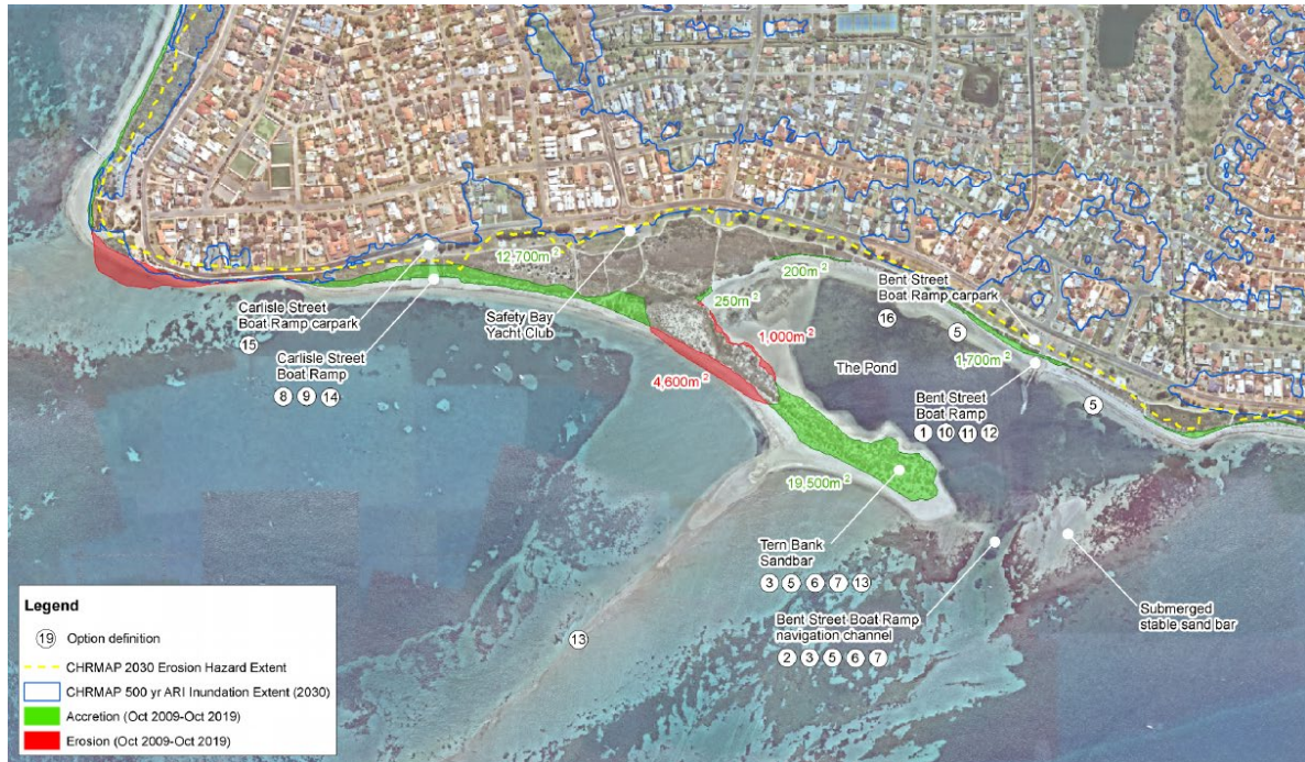
Figure 4: Accretion and erosion at sector 5