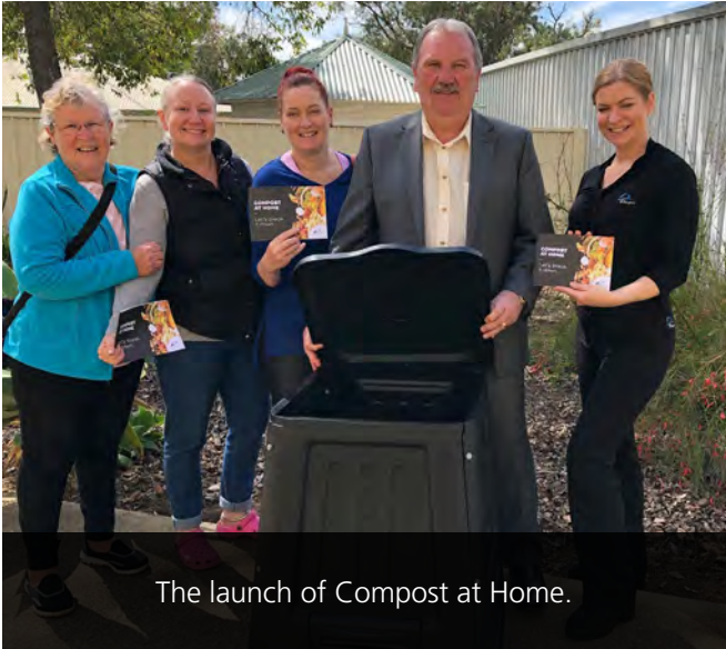
The launch of Compost at Home.