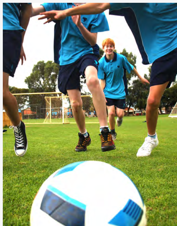
Having fun with friends is the reason I wake up in the mornings, 2019

Entries for the Act Belong Commit PhotoVoice Competition can be submitted from Sunday 1 August until Tuesday 31 August 2021. Show us how you 'Act Belong Commit' to being mentally healthy in Rockingham. PhotoVoice participants take a photo based on the Act Belong Commit theme and provide a short description explaining the photo to give it a 'voice'. There are great prizes on offer and you may see your photo on display at the Gary Holland Community Centre. The 2021 competition also has a new category for local community groups and clubs with a first prize of $500. Read more about the competition at rockingham.wa.gov.au/photovoice